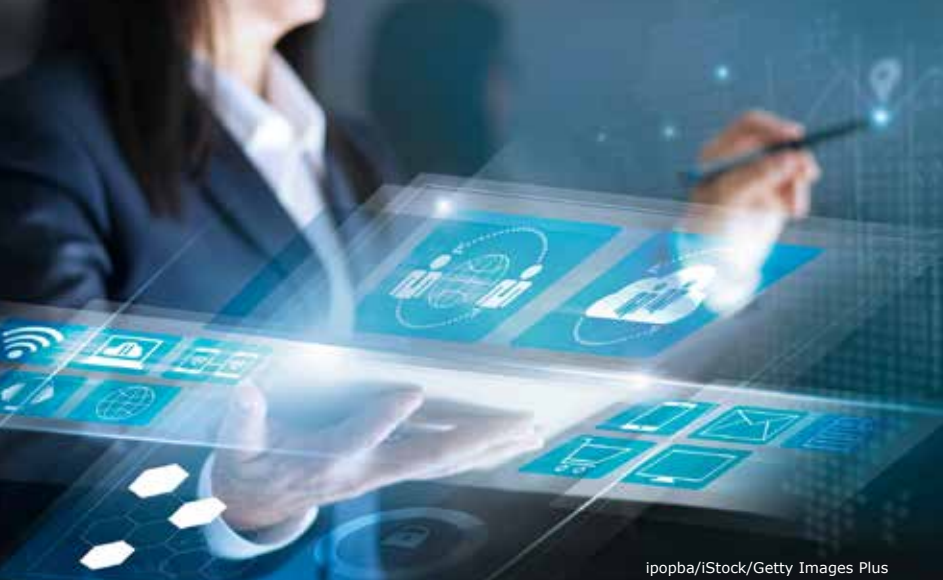
▲ No matter which tool is used, it is important to track the rate at which prices are rising or falling.

Employment Cost Index (ECI). The ECI is a quarterly report that measures the costs of compensating employees. It doesn't monitor inflation specifically; however, it is a good indicator of many of the pressures that often lead to increased prices. You can find the latest ECI data here: <u>http://www.bls.gov/news.release/eci.toc.htm</u>.