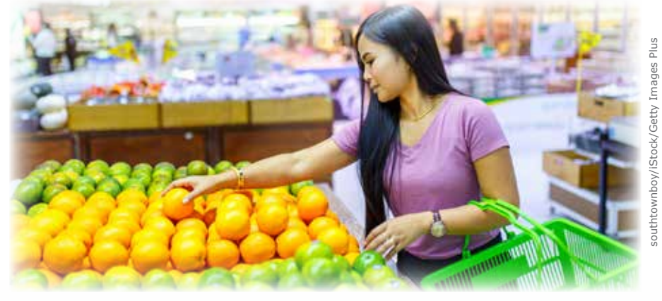
▲ If an unexpected winter storm damages orange trees in Florida, you can bet that the price of oranges is going to go up!

• Supply shock occurs because of an unexpected event, pushing up costs and prices. For example, suppose that an oil spill destroys a considerable percentage of the lobster population, making lobsters much scarcer this season. This causes lobster dishes to become more expensive for restaurants to make and, therefore, more expensive for customers to buy.